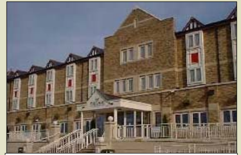
Village Hotel, Dudley, West Midlands

Online registration is now available on the Family Assistance Foundation's website at www.fafonline.org in the very near future. Check the website for updates or join the FAF mailing list to receive future updates. Registration does not include accommodations, but for those delegates requiring overnight